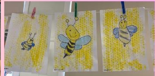
The supercalifradgalisticexpialidocious students of bugbug