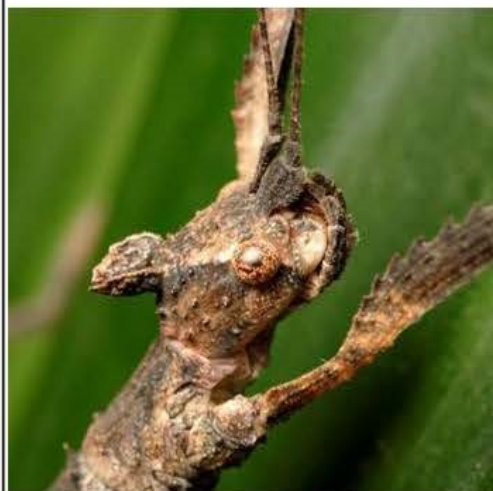
Both males and females have tiny crowns on the top of their heads.