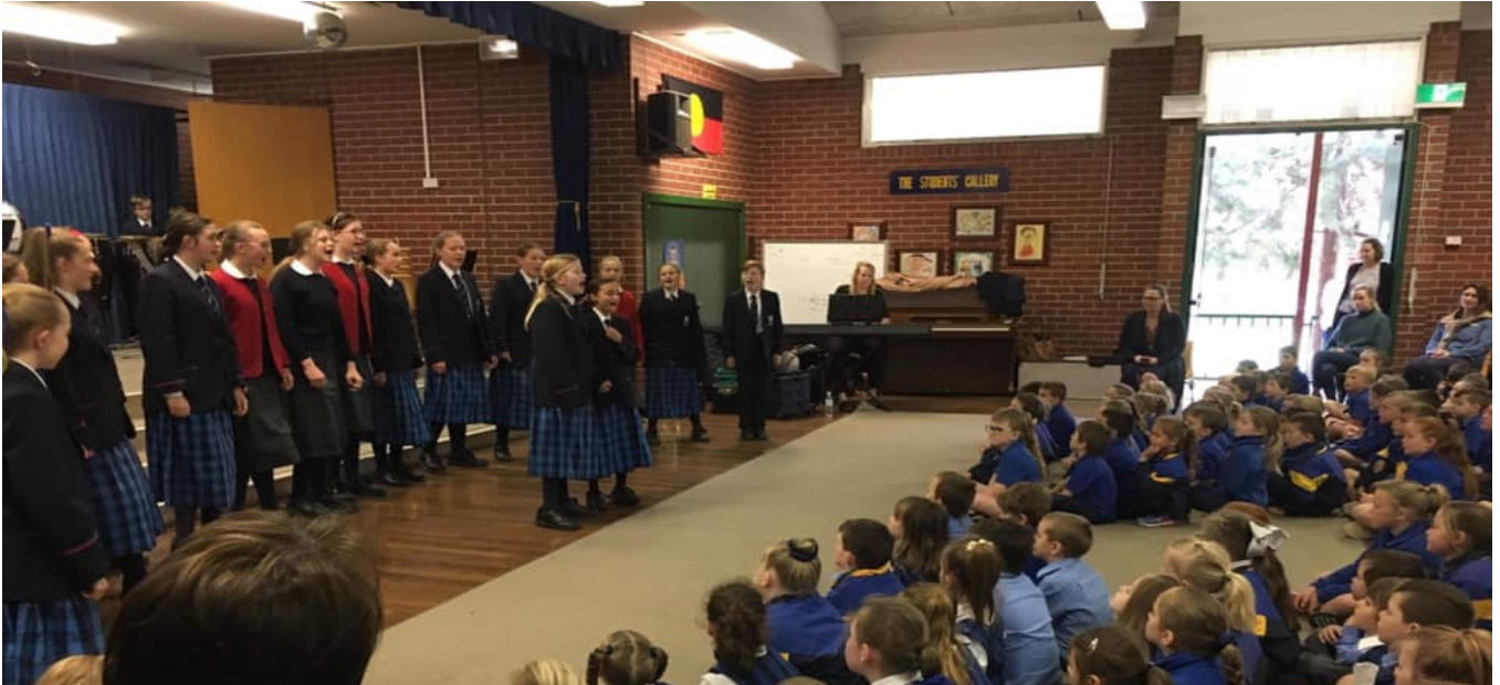
All Saints College Middle School Band and choir visited Cowra Public School. The students enjoyed the performances and our school band members were lucky enough to enjoy a workshop with our visitors.