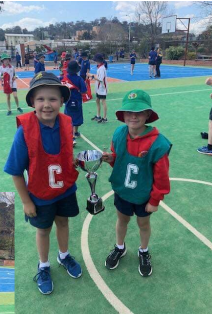
Our students had a wonderful time recently playing Lunchtime Soccer.

There was great excitement when the final was played.